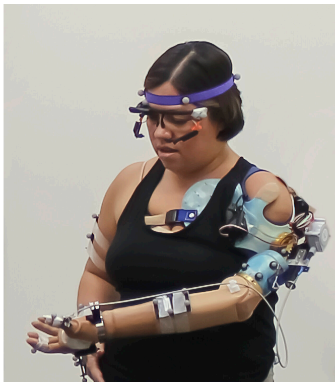
A participant at Cleveland Clinic with her advanced prosthetic arm that feels grip movement sensation, touch on the fingertips, and is controlled intuitively by thinking. She wearing reflective markers on her arms and body that help a computer see her movements in a 3D environment. Her glasses allow a computer to see exactly what her eyes are looking at in the space around her.

While wearing the advanced prosthetic, participants performed tasks reflective of basic, everyday behaviors that require hand and arm functionality. With their newly developed advanced evaluation