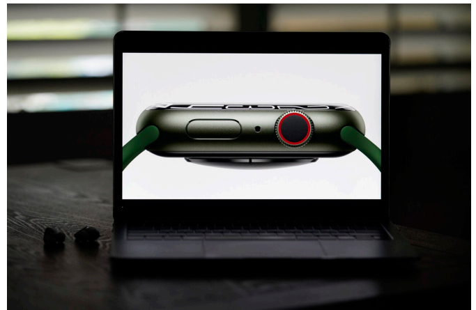
Seen on the screen of a device in La Habra, Calif., the Apple Watch Series 7 is introduced during a virtual event held to announce new Apple products Tuesday, Sept. 14, 2021.

That boom has helped push Apple's stock price near its all-time highs recently, giving the company a market value of about $2.5 trillion—more than twice what it was before the pandemic began 18 months ago.