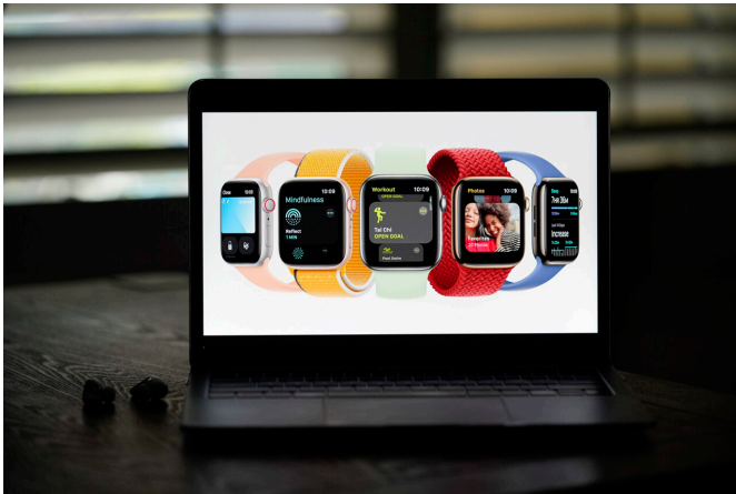
Seen on the screen of a device in La Habra, Calif., new Apple Watch Series 7 models are introduced during a virtual event held to announce new Apple products Tuesday, Sept. 14, 2021.

"We keep making the iPhone more capable," Apple CEO Tim Cook boasted.