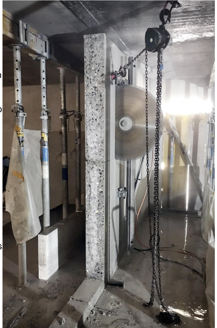
Extracting the blocks.

This project, which received funding from an ENAC Innovation Seed Grant, opens up promising new research horizons for SXL. Fivet explains: "Most buildings in Switzerland are made out of concrete, and producing this raw material accounts for 7% of CO 2 emissions from anthropogenic activity. What's more, concrete makes up 50% of demolition waste. When the material reaches its end of life, it's at best broken down into gravel or granulate to create recycled forms—but that consumes a lot of energy. If we were instead to cut up concrete blocks and reuse them, we could both prevent the need to produce more concrete and eliminate the inert waste. The carbon emissions from this process