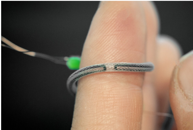
Caption: The key features of the new fiber architecture include its extremely narrow size and use of inexpensive materials, which make it relatively easy to structure the fibers into a variety of fabric forms.

As an initial test application of the material, the team made a type of undergarment that singers can wear to monitor and play back the movement of respiratory muscles, to later provide kinesthetic feedback through the same garment to encourage optimal posture and breathing patterns for the desired vocal performance. "Singing is particularly close to home, as my mom is an opera singer. She's a soprano," she says. In the design and fabrication process of this garment, Afsar has worked closely with a classically trained opera singer, Kelsey Cotton.