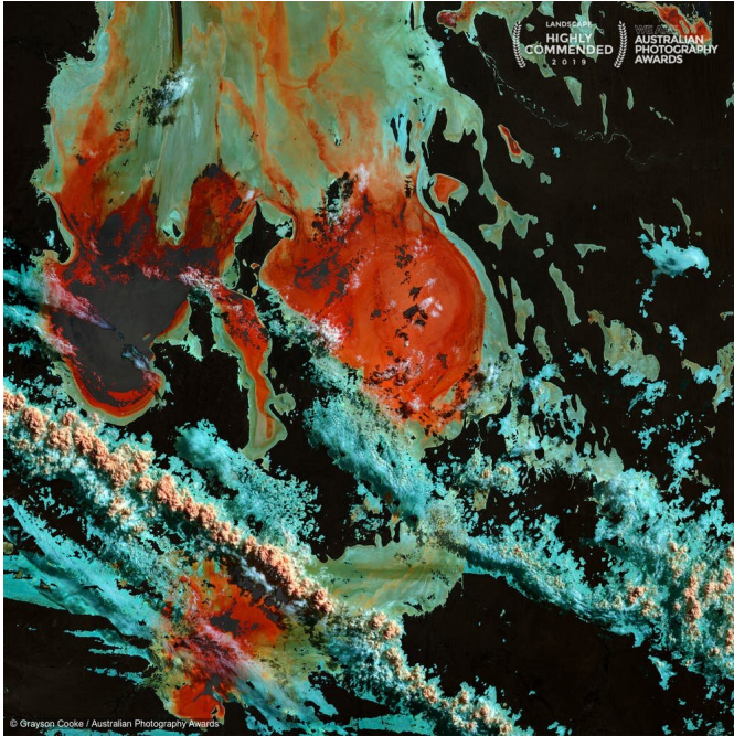
'Invalid Data: Kati Thanda / Lake Eyre 12/03/2017' (2019). This Landsat 8 satellite image shows clouds over Kati Thanda / Lake Eyre on March 12 2017.

Scientists use the infrared bands to study plants and water . When we used them to render clouds, we discovered startling colors, textures and forms.