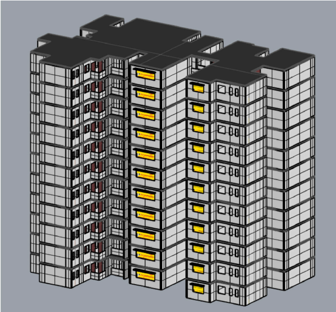
Drawing of Dorm A located in the eastern part of Singapore. Credit: SUTD

In Singapore, one group affected by the pandemic early on were the foreign workers, especially during 2020's spike in COVID-19 cases in dormitories. While several factors have been cited as factors driving the spike, the pandemic ultimately shone a spotlight on the densely packed living conditions—an environment ripe for viral transmission.