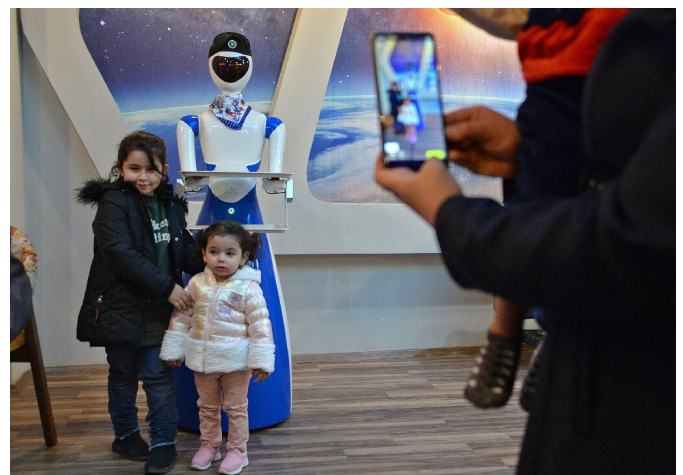
Children pose for a picture next to a robot waiter.

An astronaut floating across the muralled wall sets the scene and views of Earth and other planets as seen from space give customers the sense of peering out through the portholes of a spaceship.