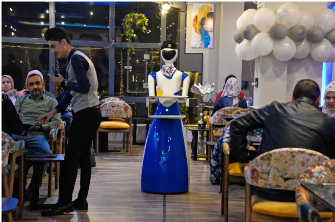
A robot waiter carries a bill to patrons of the White Fox restaurant in the northern Iraqi city of Mosul.

From the rubble of Iraq's war-ravaged city of Mosul arises the sight of androids gliding back and forth in a restaurant to serve their amused clientele.