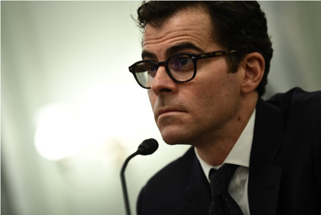
Instagram CEO Adam Mosseri testifies at a US Senate hearing.

Instagram's boss on Wednesday pushed a rosy view of the photo-sharing app's impact on teens in testimony to US lawmakers that was at odds with damning news reports based on the firm's own research.