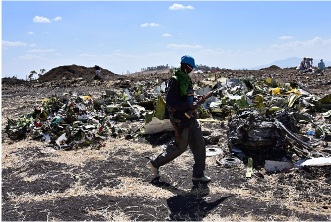
The Ethiopian Airlines plane crashed just minutes after takeoff in March 2019.

Ethiopian Airlines on Tuesday flew the Boeing 737 MAX for the first time since a crash nearly three years ago killed all 157 people on board and triggered the global grounding of the aircraft.