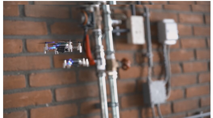
Swarm of tiny drones is able to localize gas leaks.

investigations of insect brains. Moreover, progress in sensing and computing hardware will enable robots to approach the energy efficiency and speed of insect sensing and neural processing. These developments will accelerate the creation of insect-inspired AI for autonomous robots , leading to start-ups in this field.