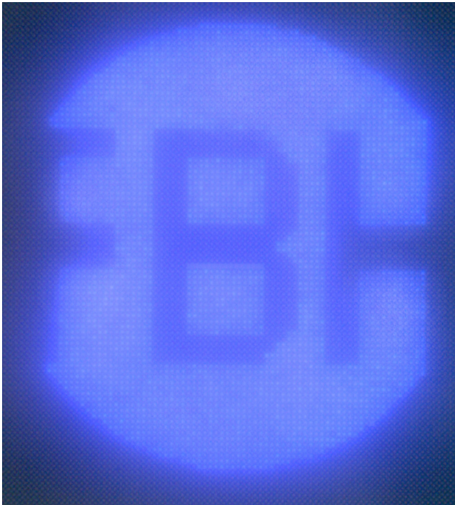
UV-luminescent pixel array of micro-LEDs with a pixel diameter of 1.5 \mu\text{m} and a 2 \mu\text{m} pitch shaped as FBH logo (diameter 158 \mu\text{m} ) under the microscope.

Researchers at the Ferdinand-Braun-Institut (FBH) in Berlin have successfully produced the first prototypes of micro-LEDs that emit in the ultraviolet spectral range (UVB). The micro-LEDs with 310 nanometers (nm) emission wavelength feature a small size of the emitting area with diameters down to 1.5 micrometers ( \mu\text{m} ). This is hundreds to thousands of times smaller than conventional UV LEDs. The micro-LEDs can be closely packed with pitches down to 2 \mu\text{m} to form a two-dimensional array on a chip, resulting in high-resolution UVB emitting areas.