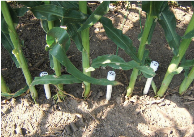
Sensors installed in a corn field.

Water is the most essential resource for life, for both humans and the crops we consume. Around the world, agriculture accounts for 70% of all freshwater use .